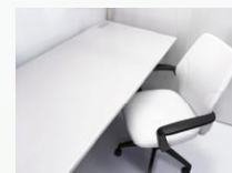
Table + Chair

Possible to measure cleanliness inside the booth within the range of ISO9~7. Equipped with magnetic mounting seat