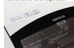
Clear operation procedure guide