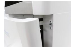
Structure for easy maintenance and inspection