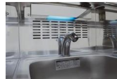
Originally equipped with germicidal light