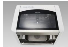
High visibility glass window